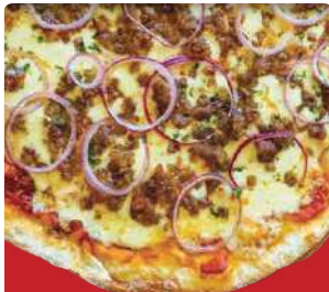
Chorizo 620 Topped with chorizo de Cebu