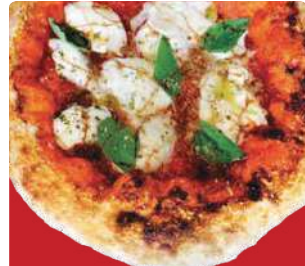
Burrata Pizza 900 Creamy burrata with basil, mozzarella, tomato & olive oil