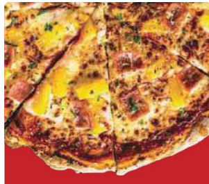
Hawaiian 600 Pineapple, ham, Parmesan & mozzarella