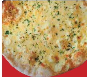
Quattro Formaggi 735 Four cheeses melted into a rich, savory blend