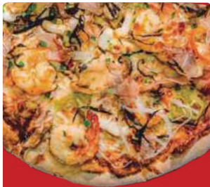
Seafood Umami 750 Shrimp, mussels, squid, soya, ginger sauce & mozzarella

Freshmade. Smoky-goodness. Unique Flavors.