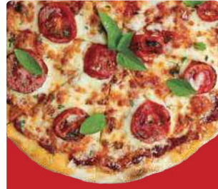
Margherita 590 Garden fresh basil, homemade tomato sauce & mozzarella