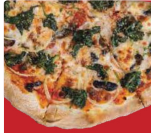
Spinach, Mushroom & Onion 590 Healthy vegetarian option!