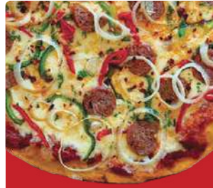
Salsiccia Picante 680 Italian sausage, capsicum, onions, tomato sauce & chili flakes